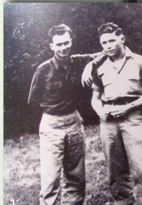
3. et 4. On July 4th, 1944, the crash of an American bomber at the pond of Chaume did seven victims. Two members of the crew survive, they are hidden and cared for in Persac and Plaisance by the Resistance. To lure the Germans, one of them is supposed to be drowned in the pond, the second is buried in the cemetery, but the coffin was filled with stones.